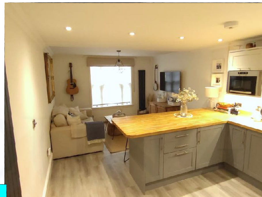
Living Room & Kitchen